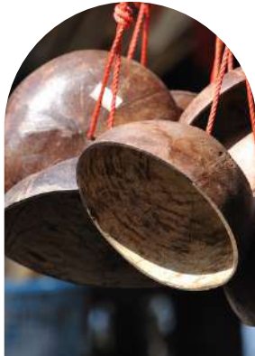
COCONUT SHELL BOWL PAINTING