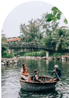
VIETNAMESE BASKET BOAT