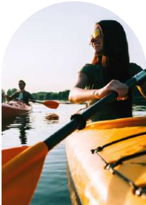
VILLAGE ADVENTURE BY KAYAK/STANDUP PADDLE BOARD

Feel the thrill as you race through the waters on a jet ski, ride the waves on a wakeboard or enjoy a heart-thumping ride on the all-time favourite banana boat designed for families.