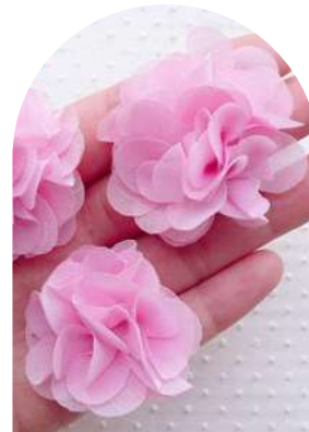
CHIFFON FLOWER MAKING