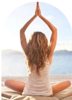
YOGA FOR CONNECTION