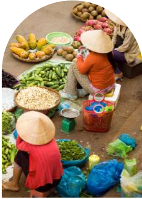
LOCAL MARKET EXPERIENCE

Whether it's the rich local culture or natural environments, explore the best that Lang Co's vicinity has to offer.