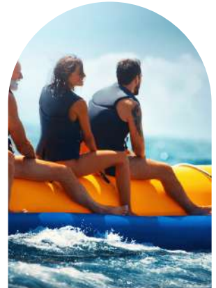
BANANA BOAT RIDE

All watersport activities are subject to weather conditions and subject to change or cancellation. For more information, please contact our Reception Desk.