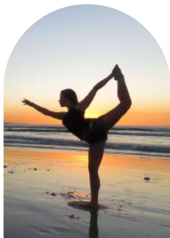
YOGA FOR WEIGH LOSS