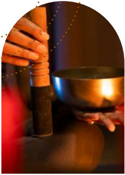
SINGING BOWL THERAPY