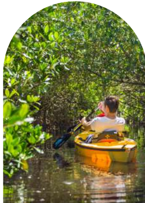
MANGROVE FOREST DISCOVERY