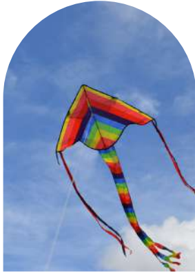
TRADITIONAL KITE MAKING

Whether it's the rich local culture or natural environments, explore the best that Lang Co's vicinity has to offer.