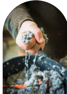
RECYCLED PAPER MAKING