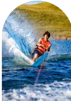
WATER SKI/WAKE BOARD