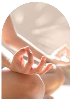
YOGA FOR BEGINER