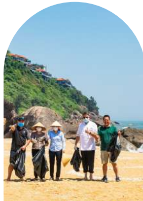
BEACH CLEANING UP