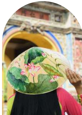
CONICAL HAT PAINTING