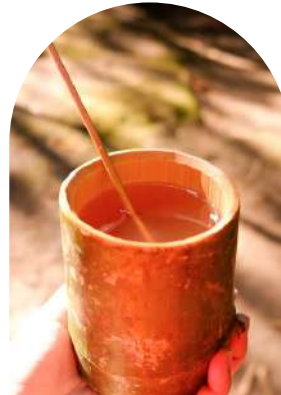
BAMBOO CUP PAINTING