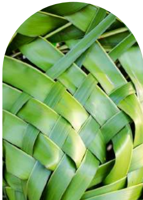
COCONUT LEAF FOLDING