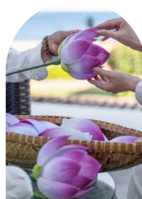
LOTUS PAPER MAKING