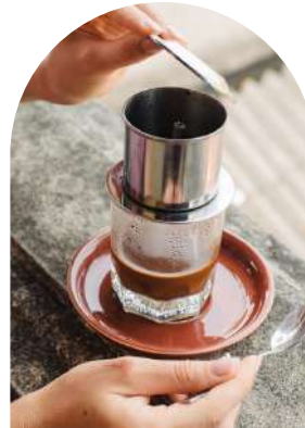
HOW TO MAKE VIETNAMESE COFFEE